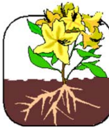
The Good Soil