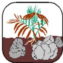
The Rocky Soil