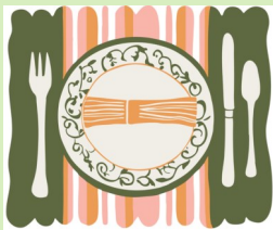
Women Without Reservations