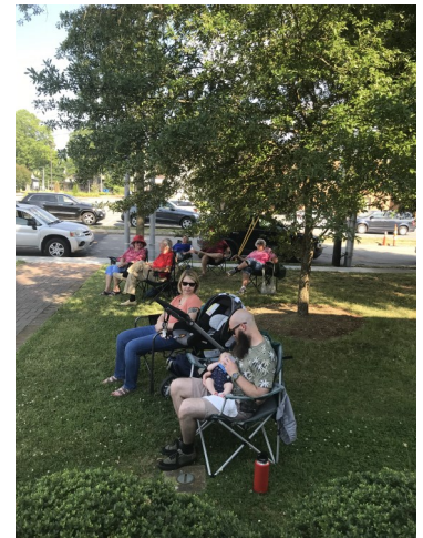
Our first Summer Singing on the Steps was enjoyed by all ages.