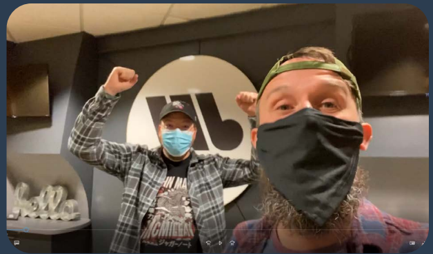
CLICK FOR SUNDAYS ARE BACK (HSV) VIDEO

Save the date: Crossings at Jonathan Creek Summer Camp is coming July 12-16. This camp is for students in grades 6-12. Registration information coming soon!