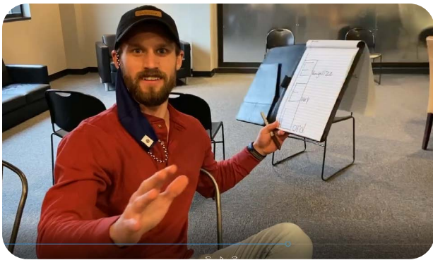
CLICK FOR FISH FRENZY VIDEO

Fish Weekend is an action-packed weekend of discipleship for grades 6-12 with challenging messages and deeply meaningful worship. We'll spend time at church taking part in all sorts of fun activities and our young adult leaders will provide direction and discipleship throughout the weekend. Notebooks will be provided - please bring your Bible and a pen.