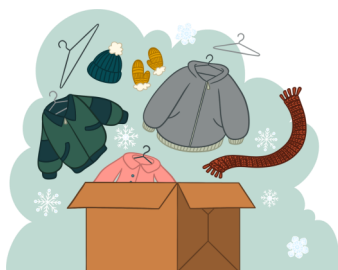
Coats for Kids

Coats for Kids! King College students are having a coat drive for kids in our area. We have agreed to be a collection site for any gently used or new coats, scarves, or mittens. There is a box outside the church office for collecting, and since the weather predictions are for a cold, snowy winter, these offerings will be especially appreciated. You might be the reason a child can go outside and play in the snow...or be warm while waiting for the school bus. What a great way to give back to the community!