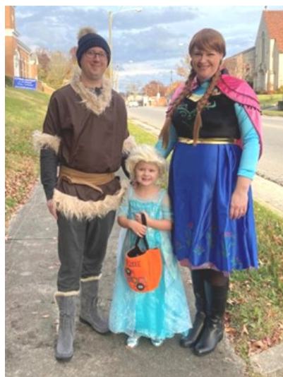
The Blevins family