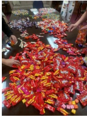
Candy, Candy, Candy!