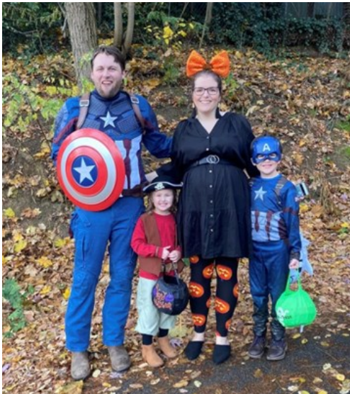
The Coker family