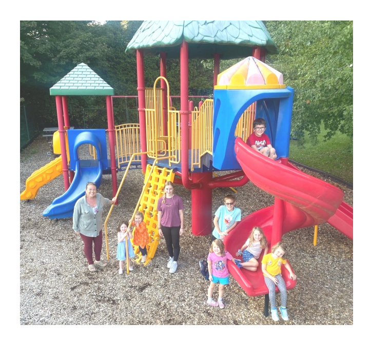
Wednesday Night fun at Central!