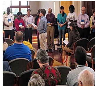
Peace & Justice