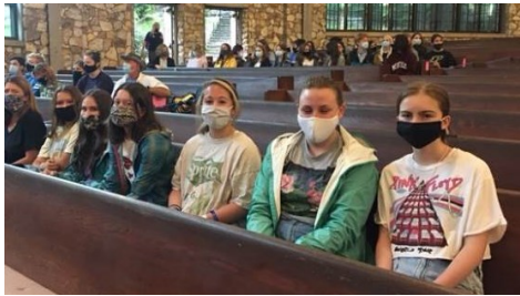
At the Morning Keynote