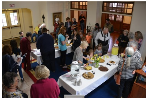
Reception after worship.