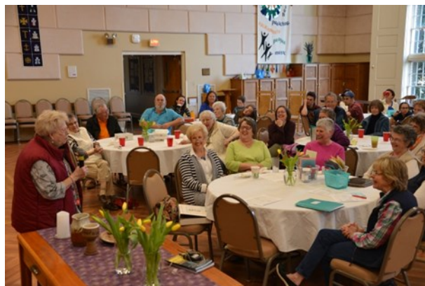
Wednesday Night Accolades