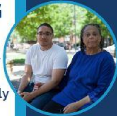
CECE, living with hATTR amyloidosis, with her son

Content sponsored and provided by Alnylam Pharmaceuticals. The Bridge is a registered trademark of Alnylam Pharmaceuticals, Inc. © Alnylam Pharmaceuticals, Inc. All rights reserved. NP-USA-00067-V2