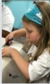
Crafts were one of the highlights of each night!