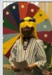
Our SWAP team helped us so much!