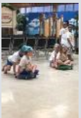
The games were fun and kept everyone engaged.