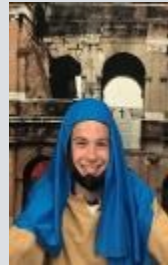
The actors were great and helped us learn about Paul's journey.