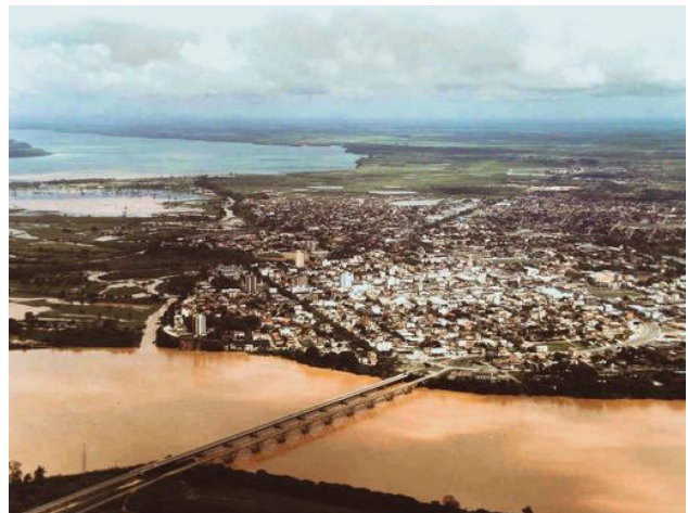
City of Linhares