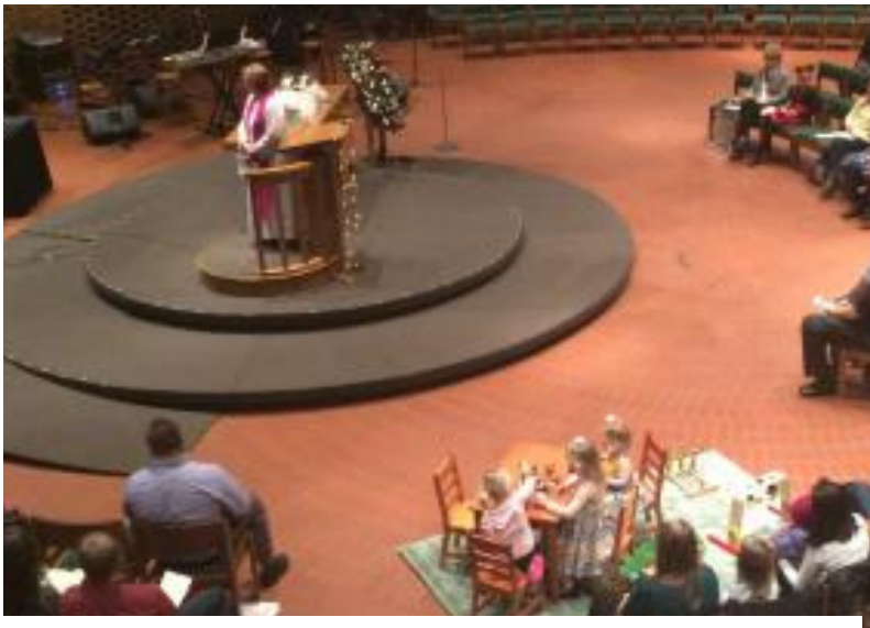
A circular sanctuary includes Grace Space, the playground at First United Methodist Church in Holland, Mich.

As the band at Trinity United Methodist Church in Grand Rapids, Michigan, played the first chords of "All the People Said Amen," 22-month-old Liam sat on a soft blanket on the floor at the front of the sanctuary playing with a red rubber ball. A few measures in, the toddler stood up, moved to the aisle and started bouncing up and down with the rhythm of the music.