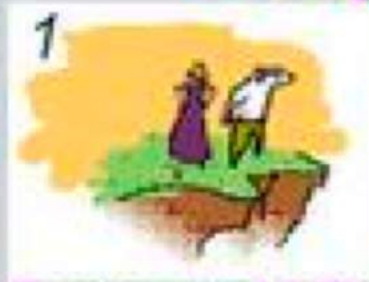
Peace and Life