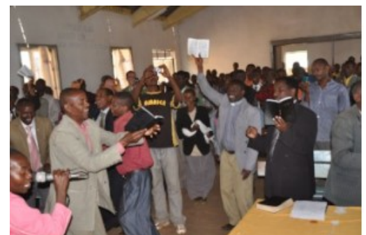
Joy in receiving the Koorete New Testament translation